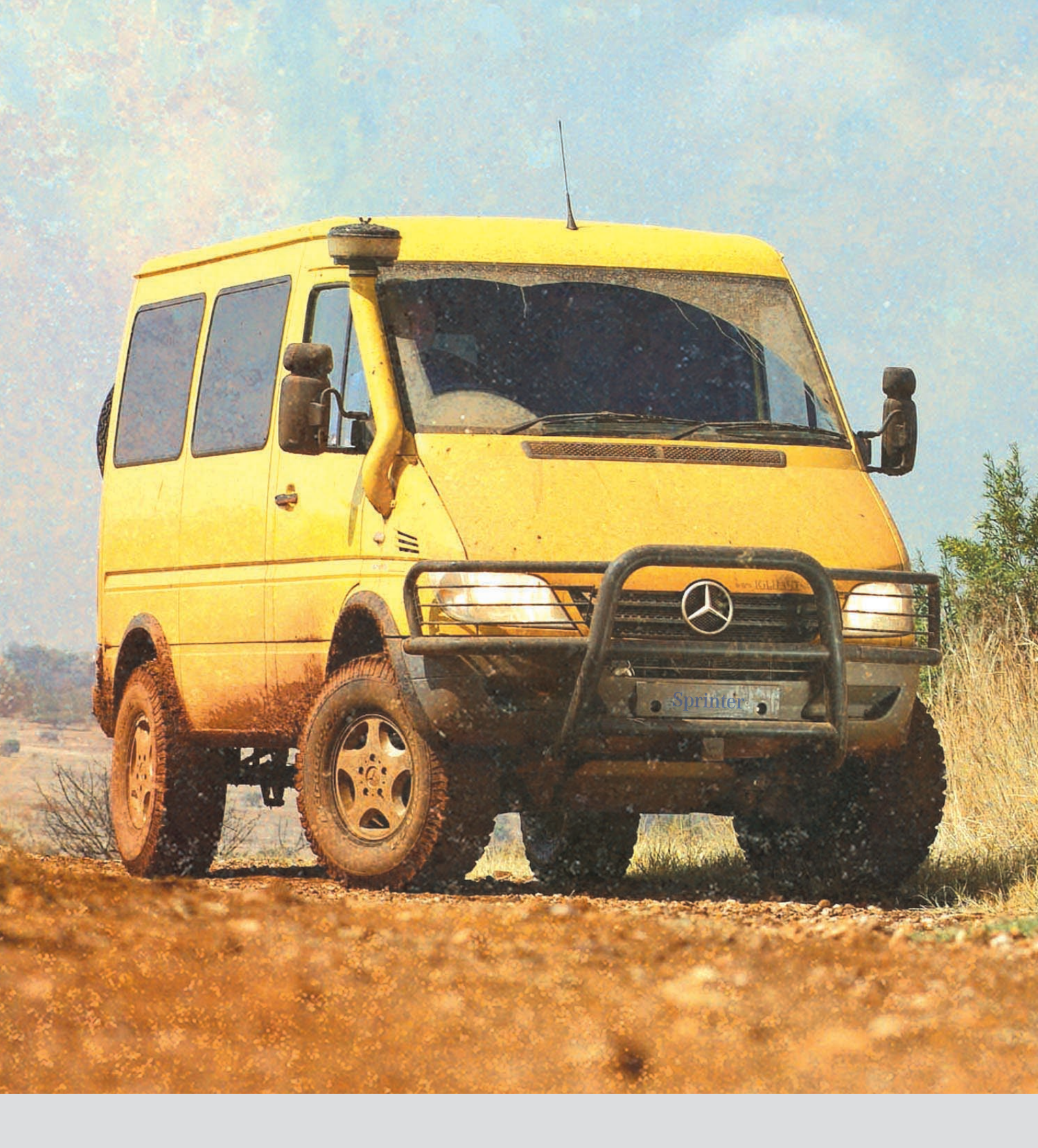
The Sprinter 4x4